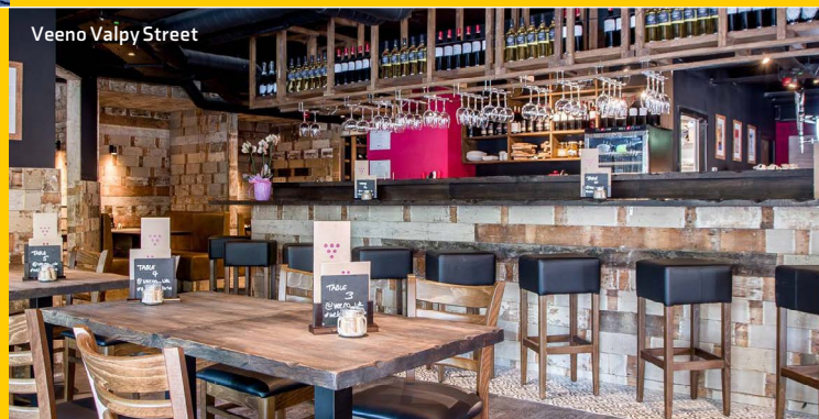
Veeno Valpy Street

Travel to London Paddington in just 23 minutes